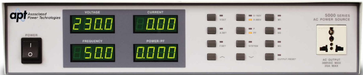
Figure 2: APT Model 5005 Manual AC Power Source

of manual AC power sources (Figure 2) provides a simple interface that allows manufacturers to easily comply with international testing standards. For test operators that are just getting started with compliance testing, or are more budget-conscious, this line of AC power sources provides all the features necessary for safe and efficient testing at an affordable price point.