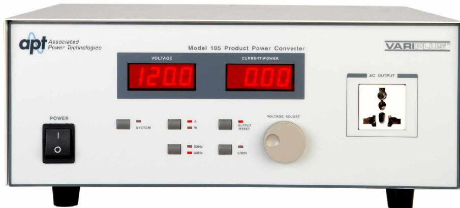
Figure 1: APT Model 105 VariPLUS Power Converter

(Figure 1). The VariPLUS is a no frills alternative to a variable transformer and can output voltages at 110% of nominal operating voltage at either 50 or 60 hertz.